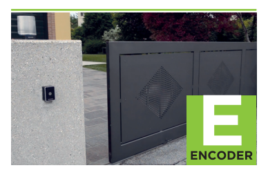
Optional versions with Encoder for more accurate and safer deceleration.