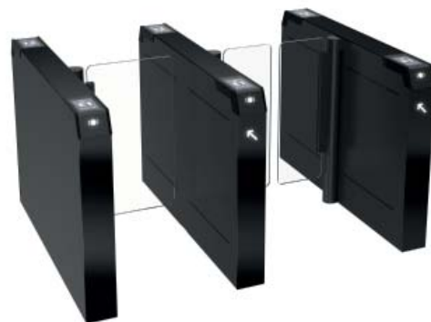
EasyGate LiftCall / 990 mm