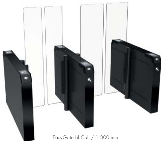
EasyGate LiftCall / 1 800 mm