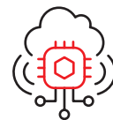
Seamless integration with third-party systems and hardware