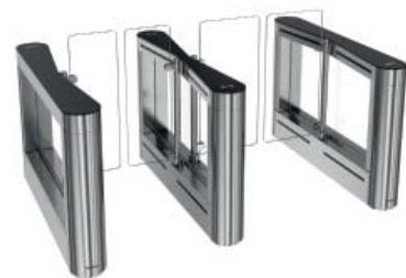
EasyGate SPT-G Outdoor