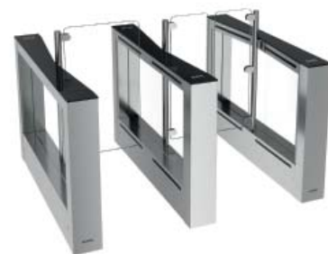
EasyGate SPT-R Outdoor