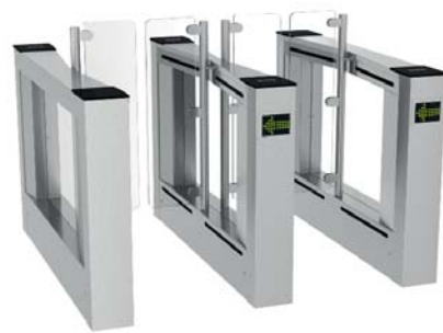
All dimensions in mm (inches).