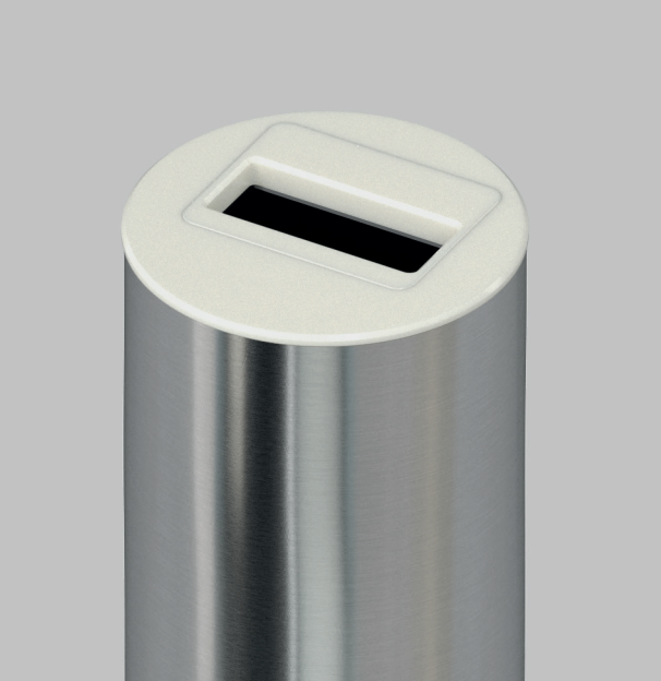
EXI Badge (Built-in)