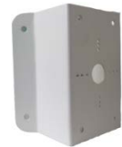
DS-1276ZJ Corner Mounting Bracket