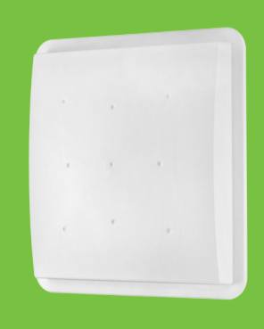
UHF 5 series