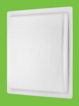
UHF 10 series